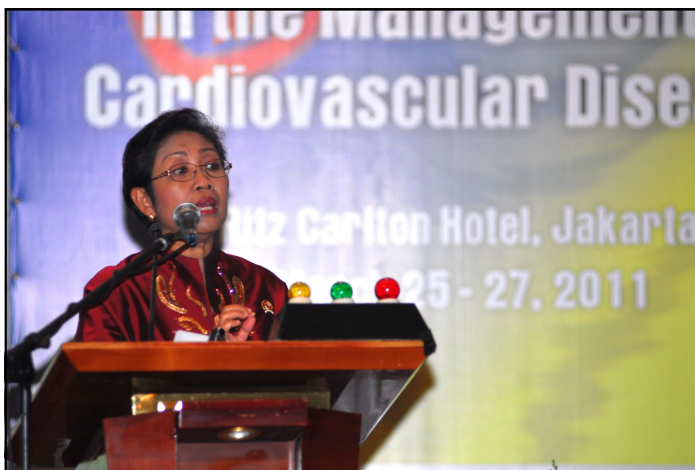
Dr. Endang Sedyaningsih Rahayu, MD, MPH, Indonesia Minister of Health